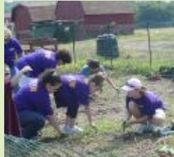
Kohl's employees weed the garden

entire Ranch campus. Some employees returned on June 22nd to paint the rest rooms in the gym. Kohl's staff members gathered at the Ranch on June 17th for their annual "Day of Caring" to pull weeds and plant vegetables in the garden. The garden and landscaping look beautiful and the Ranch is so grateful to these organizations who give so generously of their services.