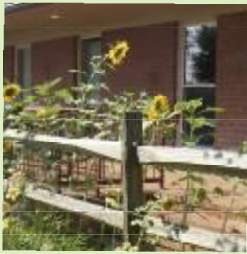
Marriott planted sunflowers in front of the Wright Building

The Ranch was blessed once again this spring to have employees of Marriott Corporation and Kohl's donate their time and services to the Ranch. On May 18th, a bus load of Marriott employees arrived to weed flower beds and plant flowers over the