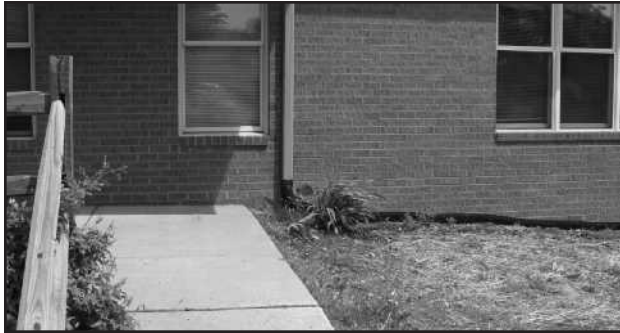
Wright Building before Marriott

On Wednesday, May 19th, the Maryland Sheriffs' Youth Ranch was buzzing with activity as Marriott Corporation made a very special visit. Tools, paint, supplies, and two busloads of people filled the parking lot to begin a day's work. The dining room received not only a fresh coat of paint, but a beach scene mural. The barn fence, the railing in front of the Administration Building, and the picnic tables in the pavilion were painted. Shrubs were pruned and old bushes were removed and replaced with new ones. A vegetable garden was planted with a fence and a Marriott Scarecrow to guard it. The landscaping around the flagpole was reconstructed. The Ranch looked fresh and new when they were finished. What a blessing it was to witness the hard work and the willing hearts of the volunteers. We are so fortunate to have organizations such as Marriott who give back to the community. Thank you, Marriott, for putting action to your beliefs!