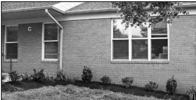
Wright Building after Marriott

On Wednesday, May 19th, the Maryland Sheriffs' Youth Ranch was buzzing with activity as Marriott Corporation made a very special visit. Tools, paint, supplies, and two busloads of people filled the parking lot to begin a day's work. The dining room received not only a fresh coat of paint, but a beach scene mural. The barn fence, the railing in front of the Administration Building, and the picnic tables in the pavilion were painted. Shrubs were pruned and old bushes were removed and replaced with new ones. A vegetable garden was planted with a fence and a Marriott Scarecrow to guard it. The landscaping around the flagpole was reconstructed. The Ranch looked fresh and new when they were finished. What a blessing it was to witness the hard work and the willing hearts of the volunteers. We are so fortunate to have organizations such as Marriott who give back to the community. Thank you, Marriott, for putting action to your beliefs!